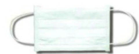
Non-woven 無紡布 7 枚 pcs

SUZURAN BABY Non-woven Face Mask 7pcs 鈴蘭 嬰兒用 無紡布口罩 7 枚