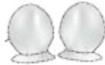
gauze/ 紗布 2 对 pairs

SUZURAN BABY Gauze Mittens 2 pairs 鈴蘭 嬰兒用 紗布手套 2 對